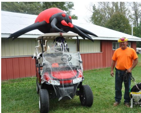
Golf Cart Winner