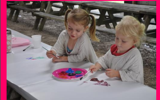
To of the cutest cuties I know painting their paper airplane on Grandparents Weekend.