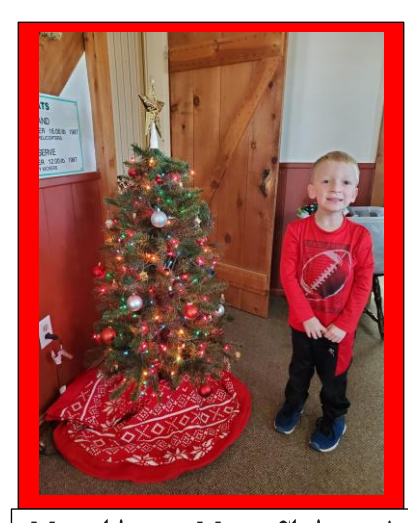
Memphis says Merry Christmas!