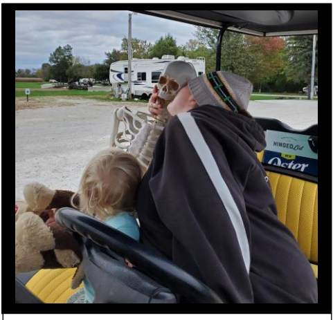
Don't tell Tim!!!