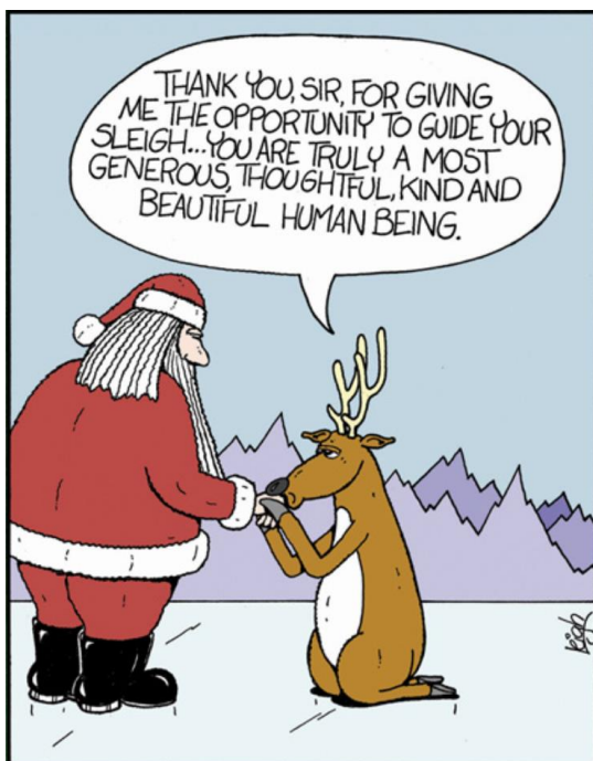
Rudolph the brown nosed reindeer

Finally, thank you for staying with us. I don't think we could go cold turkey from our campers every year. We love being here for you guys and making sure that your stay is as pleasant as possible. We hope that you all have a very Merry Christmas and a safe and Happy New Year. Let's Go Campin'!