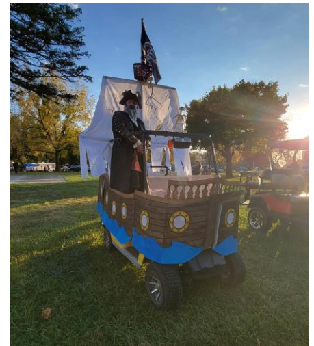
Best Golf Cart