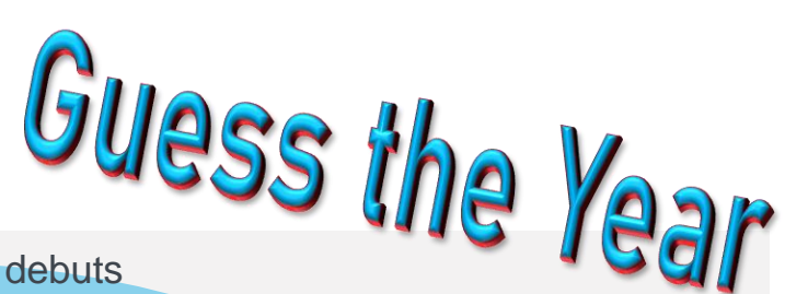
Blind Quarter Auction