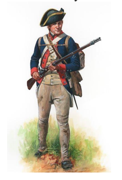
British Army Soldier